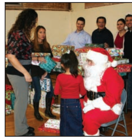
Hoboken Christmas party

The Hoboken community never compromises when it comes to providing their children the best Christmas possible. Annually sponsored by the Hoboken Rotary Club, and the Hoboken Chamber of Commerce, and new this year Toll Brothers City Living, almost 200 Club members received gifts from Santa. In addition to the toy drive conducted by the