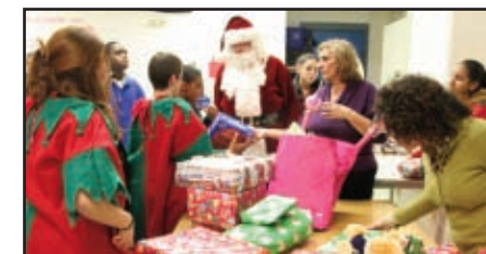
Jersey City Christmas party