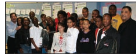
Team Verizon and participants

Verizon teamed up with the Boys & Girls Club to conduct the 2nd Technology Training Program designed to teach youth from the