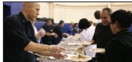
Jersey City dinner